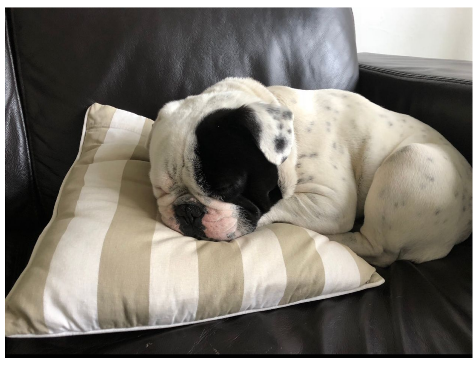
Being a rebel isn't easy.