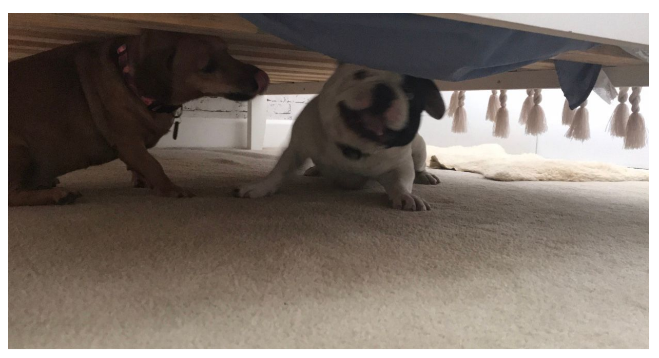
Angus picking a fight he knows he can't win.