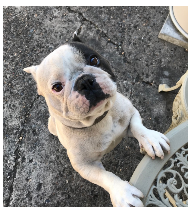
Angus covered in dirt after a bath.