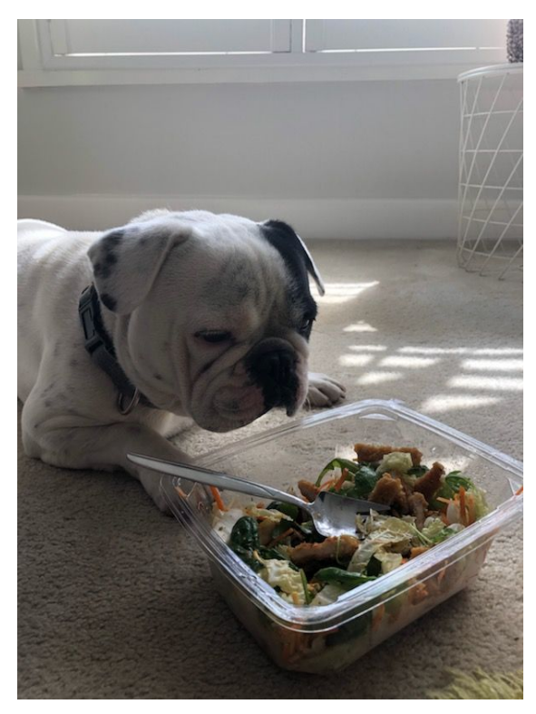
Angus eyeing off a snack.