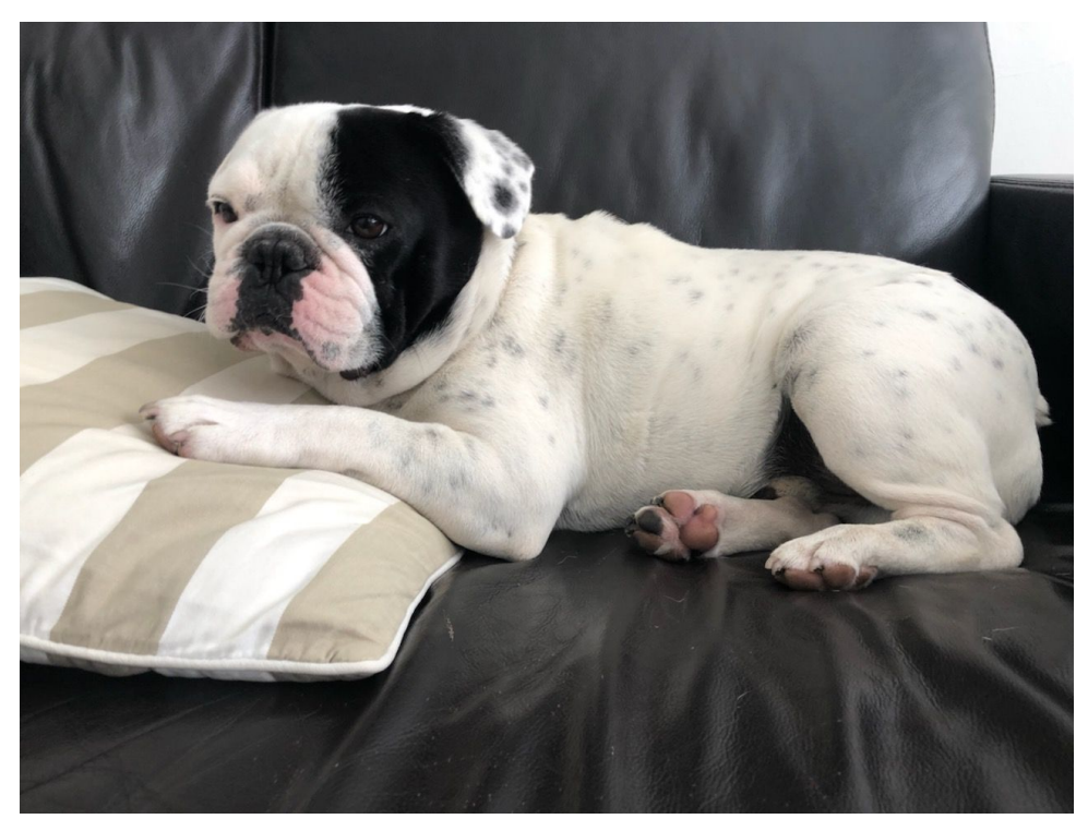
This was a long day for Angus